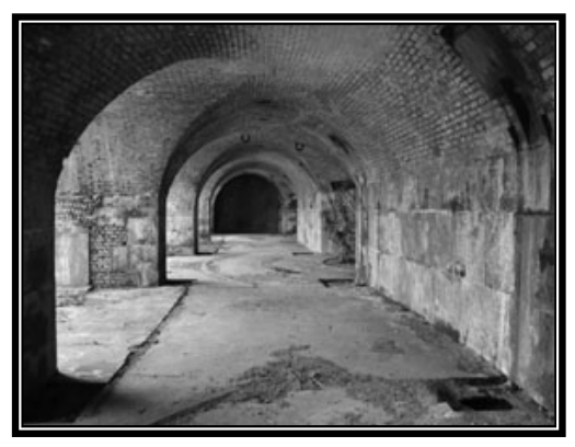
4. Gun placements inside Cliffe Fort