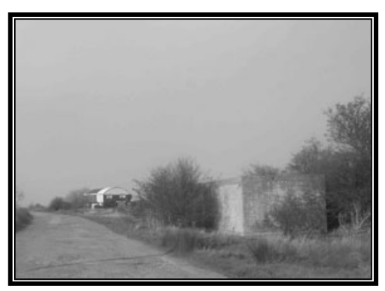
1. Generator bunker along Point Road with Boatwick House in the distance