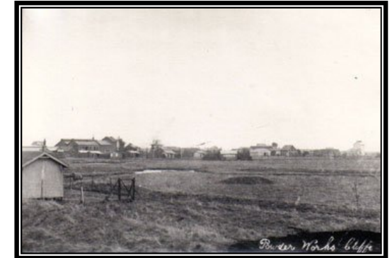
2. Curtis and Harvey Powder Works