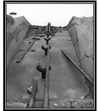
4. Brennan Torpedo launch rails