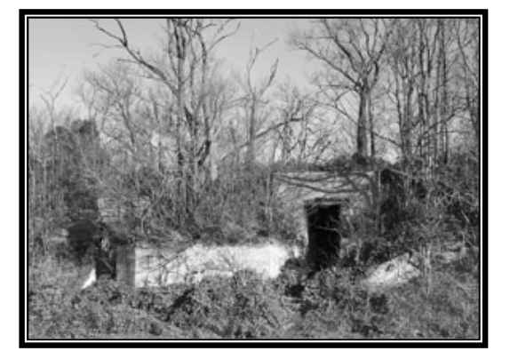
6. Air raid shelter for cement factory workers western Created using BCL easyPDF