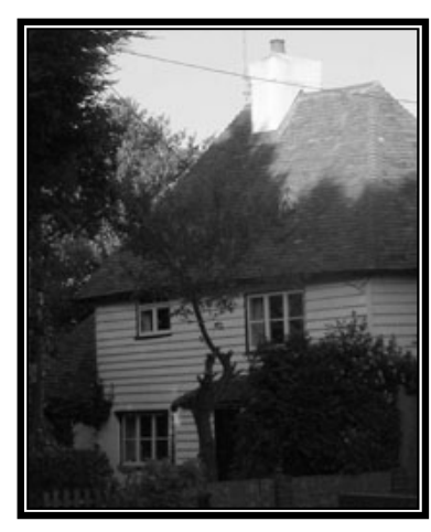
7. Walnut Tree Cottage, Wharf Lane, Grade II 16<sup>th</sup> century