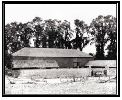
5. The Barn at Berrycourt Farm