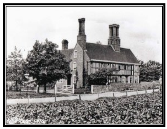
2. Manor Farm, Grade II late 16<sup>th</sup> century