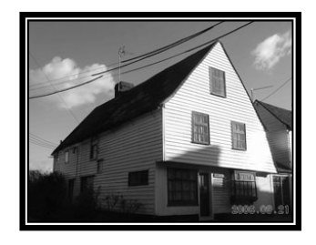
Longford House Church Street Grade II circa 1600 at one time this was a post office