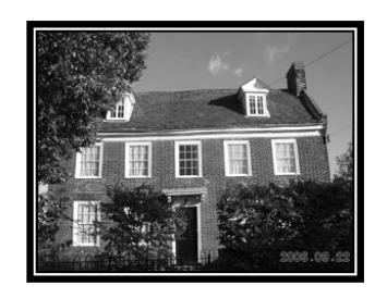
Quickrills Church Street Grade II early 18th entury