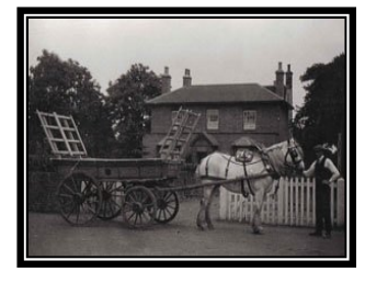
Mortimers Farm House Town Road Grade II 17<sup>th</sup> century