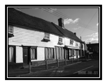
170-174 Church Street Grade II early 16<sup>th</sup> century formerly Chestertons Grocers and Parkers store

More information on some of these buildings can be found on the interpretation board located on the Buttway.