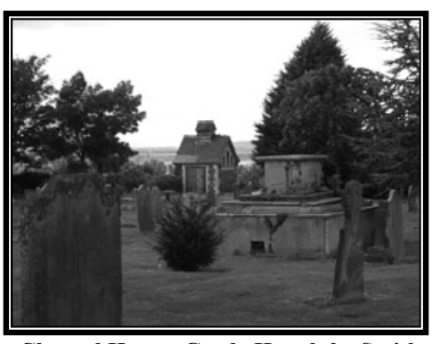
8. The Charnel House, Grade II and the Smith Monument, St Helen's Churchyard, Cliffe