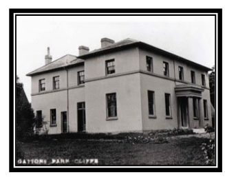
Gattons Farmhouse Grade II early 19<sup>th</sup> century