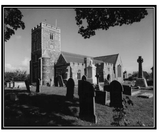
St Helens Church still has medieval wall paintings