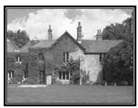
3. The Old Rectory, Grade II early 14th century