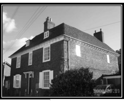
6. The Red Hous